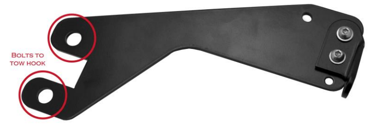
Page 2 of 4 Dodge Ram 2500 Bumper Bracket Installation Instructions (PN: 576306)