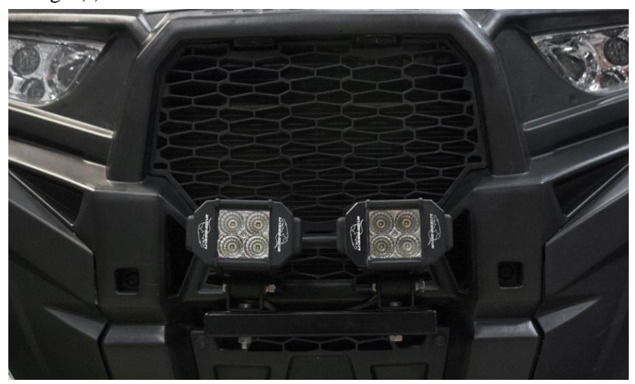
Page 2 of 3888797 RZR Grill Mount Instructions

4. Install your light(s) onto the fabricated bracket.