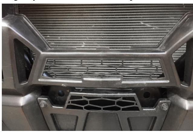
Page 1 of 3 888797 RZR Grill Mount Instructions

1. Remove your grill to give you access to behind the plastic face.